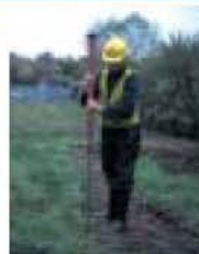
Spiker Bars and vent tubes