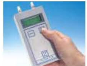
GF60 Bore hole flow monitor