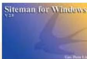
Siteman for Windows PC Utility programme