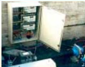
LMSp - fixed systems and custom installations